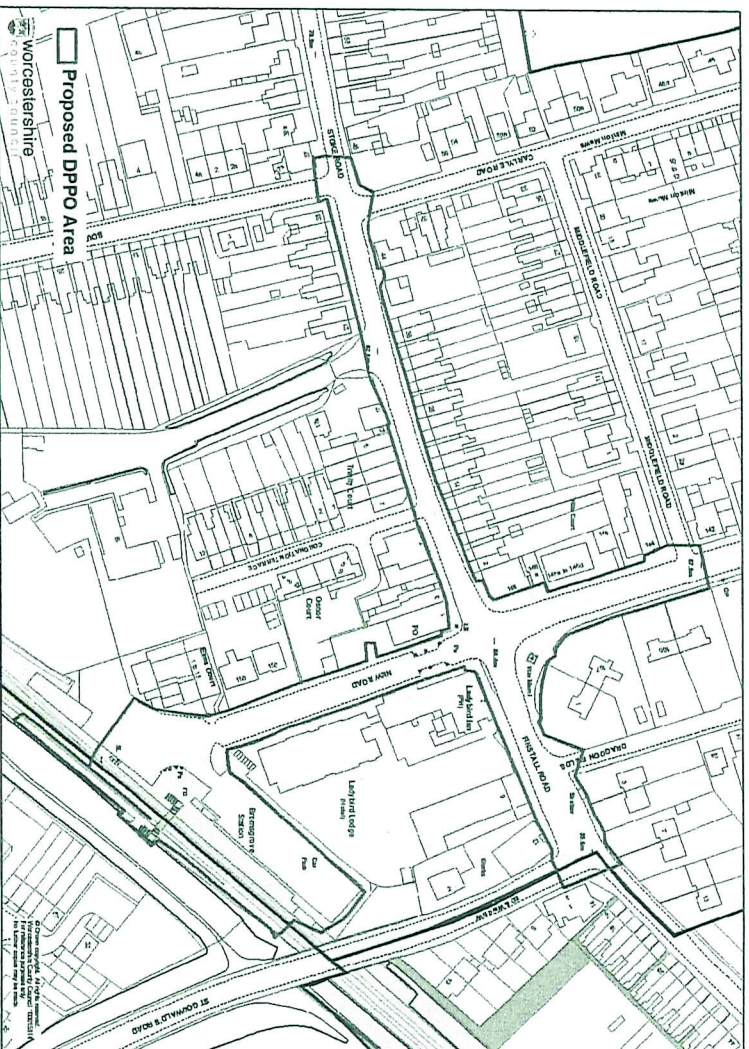
Figure 1 : Map to show the location of the proposed DPPO

Incidents and offences recorded as having occurred within 30 metres of the proposed zone have been selected for analysis in order to capture all potentially relevant reports.